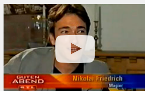
RTL Guten Abend