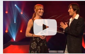
Pro 7 The Next Uri Geller, Rendezvous mit Andrea Sawatzki