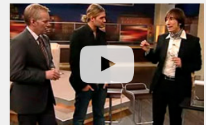
ZDF Johannes B. Kerner, Cola Flasche