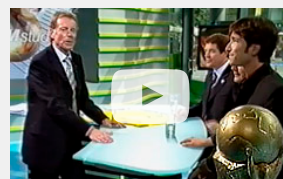
ZDF ZDF WM Studio; Vorhersage des Endspiels der Fußball WM 2002