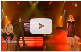
Pro 7 The Next Uri Geller, Feder mit Sonya Kraus & Jürgen Vogel