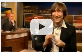
ZDF Johannes B. Kerner, Karten